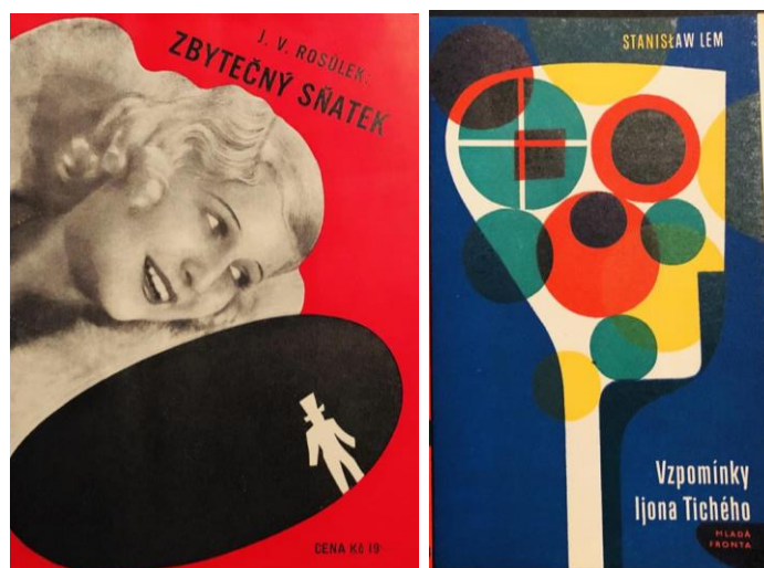
Two examples of Šváb-designed volumes.

In the fall of 2021, this was supplemented by the purchase of some sixty-six printed books that Šváb designed, dating from 1929-1967. Searching the list against the OCLC database revealed only three duplicates.